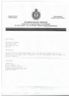
Aylmer Police return cheque.jpg 387K